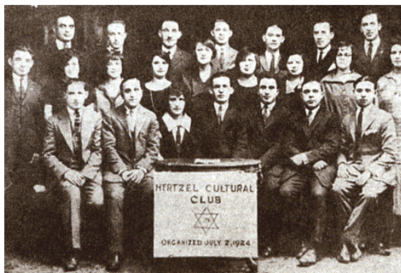
Photo: Members of Utica's Jewish Hertzal Cultural Club, organized July 2, 1924

Although the population of Jews has declined, as has the overall population of the Mohawk Valley, the Jewish community here remains vibrant.