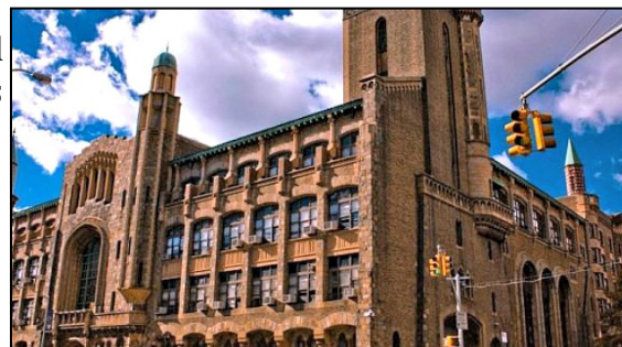
Yeshiva University High School in the Washington Heights section of Manhattan.

The Maccabees will go up against Washington College on Thursday night.